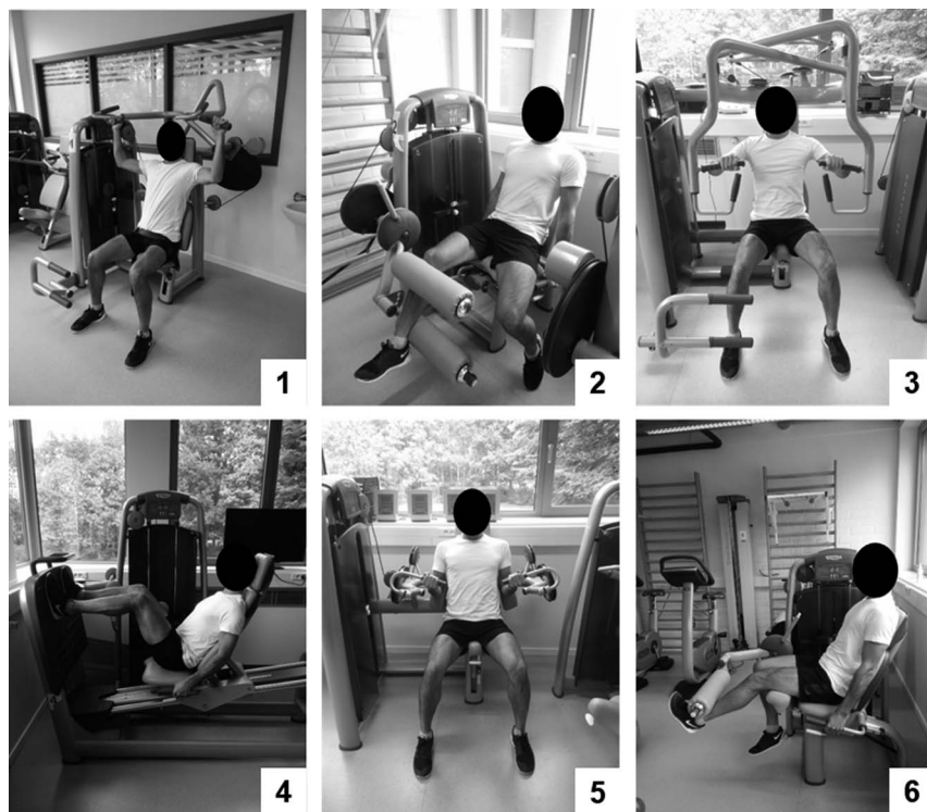
FIGURE 2—General resistance exercises. 1: vertical traction; 2: leg curl; 3: chest press; 4: leg press; 5: arm curl; 6: leg extension.

function of their ability to load the core muscles at an intensity of >60\% of the MVC (22). On the first session, patients were educated on isolated activation of specific core muscles [m. transversus abdominis, m. multifidus, m. gluteus (see Appendix, Supplemental Digital Content, core strength exercises with their estimated activation intensities, http://links.lww.com/MSS/B669 )], to minimize other compensatory muscle work during the exercises. On the second session, the physiotherapist explained and demonstrated the exercises. The participant then repeated the exercises while movement corrections were made by the physiotherapist. During the following sessions, participants performed one set of 10 repetitions of a 10-s static hold. Participants were encouraged to hold the last repetition as long as possible. Exercise difficulty was increased when the