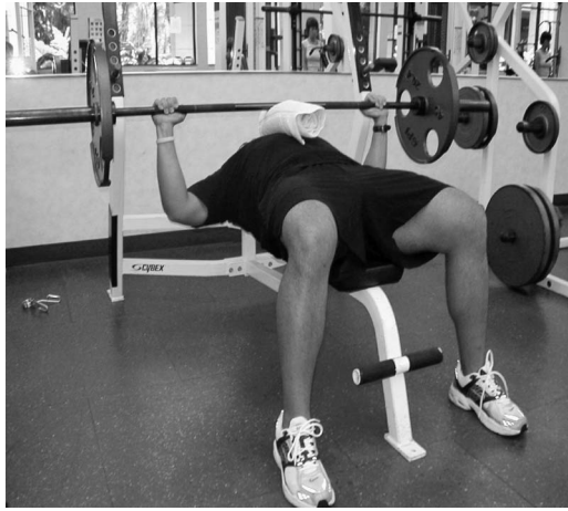
Figure 6. Bench press modification using a towel roll to limit the terminal lowering phase end-range.