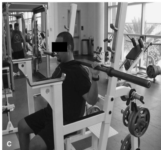
Figure 1. A) The high-five position. Position places the arm in end-range external rotation with abduction. B) The seated chest fly machine requiring the high-five position. C) The behind the neck military press requiring the high-five position.

positions requiring the humerus to be extended posterior to the trunk or that require the high-five position place stress on the anterior shoulder tissues, thus may excessively increase mobility and over time lead to decreased stability. Gross et al. (30) examined 20 subjects that were experiencing shoulder pain during RT. In the investigation, all of the subjects reported pain when assuming the simultaneous abduction-external rotation “high-five” position (Figures 1A–C), and during RT activities such as chest flies and bench press. Common clinical findings among the subjects included anterior shoulder instability purported to be a result of performing exercises that required the arm to be extended posterior to the trunk or the high-five position (30). Reeves et al. (61,62) reviewed both acute and chronic injuries resulting from RT. The authors suggested that extension of the shoulders past the trunk during bench press or chest flies contribute to anterior glenohumeral instability. Additionally, the authors suggested an association between behind the neck latissimus pull-downs, and both rotator cuff injuries and anterior shoulder instability. Yu and Habib reported an increased frequency of anterior instability and subluxation associated with the bench press exercise as a result of shoulder positioning (79).