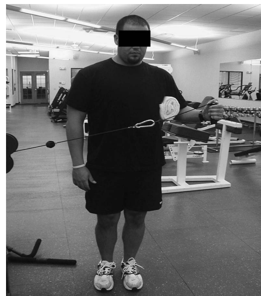
Figure 5. Standing resisted external rotator strengthening. Individual may use cables or a resistance band and brings arm from waist out to side.