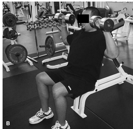
Figure 7. Modification of the dumbbell shoulder press exercise. A) Traditional form requiring the end-range high-five position, B) Modification to avoid terminal high-five position.

unfavorable shoulder positioning required of the more common exercises along with the repetitive nature of lifting heavy weight until failure, increases the likelihood of injury. Although the specific nature of many injuries was not identified in the literature, evidence was available to suggest that acute and chronic injuries may be precipitated by certain training patterns. Additionally, trends for specific types of injuries resulting from RT were identified that may serve the basis for preventative efforts.