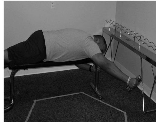
Figure 4. Prone arm abduction in the scapular plane. Individuals lie on their stomach (prone) and raise arm up to the diagonal plane while maintaining a thumb up position.

dysfunction (2,22,25,30,31,53,54,57,62,82). Upper extremity RT places the shoulder in the high-five position (required during exercises such as the behind the neck military press and pull-downs) under heavy loads creating anterior capsular overload leading to anterior instability and impingement (30,31,53,54,57). Gross et al. (30) identified anterior shoulder instability among RT participants and postulated that the high-five position frequently assumed during exercise was a contributing factor.