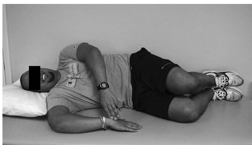
Figure 3. Internal rotation sleeper stretch. Individuals lie on side to be stretched and rolls torso back about 45°s until they are weight bearing on the scapula. Their arm is placed at shoulder level and elbow flexed 90°. Once in position, the arm with assistance of the opposite arm is brought to the table or mat while maintaining a flexed elbow. Stretch is held for 30 seconds and repeated 3 times.

Shoulder injuries in the RT population resulting from improper shoulder positioning during common exercises have been well documented in the literature (7,27,28,30,32,49,51,57,64,65,75,79). Gross et al. (30) investigated anterior