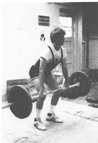
Figure 22. Extending the legs only, lift the bar to the knees.