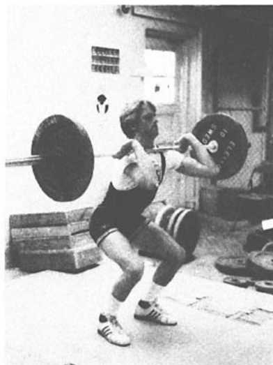
Figure 25. Rack and catch and descend into front squat to complete the movement.

The conclusion of this article will appear in NSCA Journal , Volume 10, Number 1, February/March, 1988.