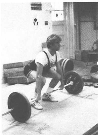
Figure 21. Begin with bar on the floor, hands closer together than before.

With the head set at either the extension of the spine posture or on the focal point, the movement should commence only with an extension of the legs. It will help to visualize the bar as a stable implement, and the floor as a moveable platform that is being pushed downward by the legs. This will result in the shoulders, hips