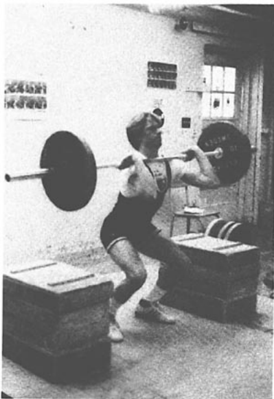
Figure 20. Rack and catch.

This exercise is the logical progression from the high pull. It is simply a high pull followed by a rack and catch. The rack is the position of the arms previously determined by the front squat. Once the bar has reached its maximum height, the elbows should be as high as possible