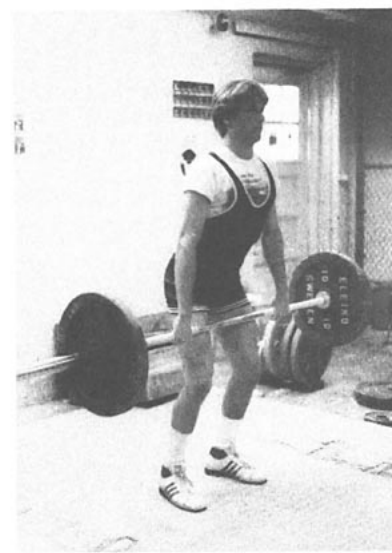
Figure 23. Beginning the power position, with body weight shifted forward.