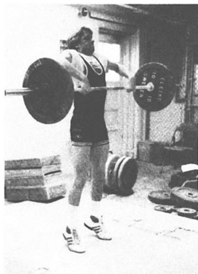
Figure 24. Balance on the metatarsals for a dynamic lift.

The athlete should practice the power clean and front squat until it is a smooth, controlled activity. Previous training off the blocks should carry over to a smooth catch and descent.●