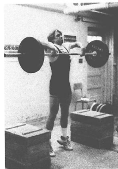
Figure 19. Elbows turn out, knees, hips and ankles extend, and trapezius contracts violently.