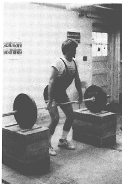
Figure 18. Beginning the high pull off blocks--hook grip.

Coaching hint: Many athletes tend to favor the use of the arms, especially in terms of incorporating them too soon. To help alleviate this tendency, some training may be performed with what is called an extension. An extension is simply a pull without bending the arms. The leg and hip extensions are employed with the trapezius shrug only to create the most violent explosion